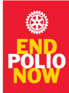
Global WPV1 & cVDPV Cases 1 , Previous 12 Months 2